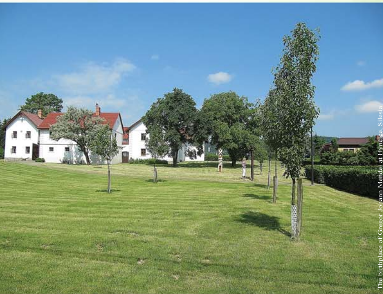
The birthplace of Gregor Johann Mendel at Hynčovice, Silesia